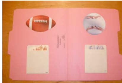
Sort footballs and baseballs

Task sets are not recommended for students who put non-edible items in their mouths.