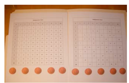
Complete the multiplication table