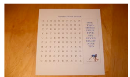
Sports word search