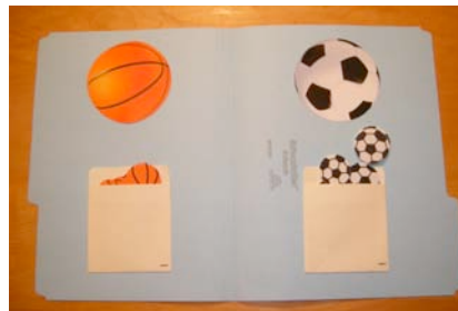
Sort soccer balls and basketballs