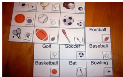
Match sports symbols