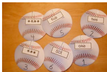
Match numbers, sets, number words