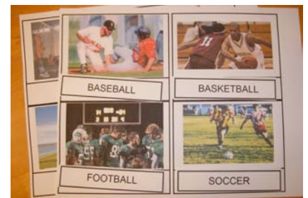
Read sports words