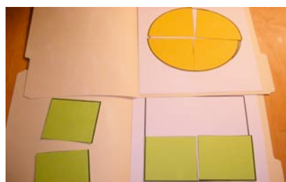
Part to whole shape