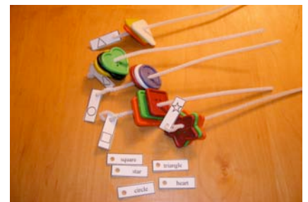
String shape buttons