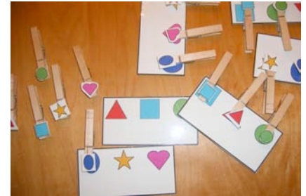
Clothespin shape match