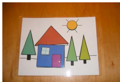
Make a shape picture