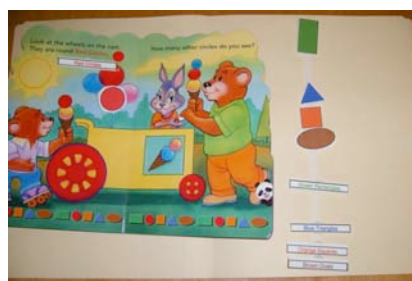
Adapted shape book