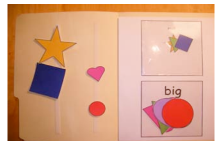
Big/little shape sort