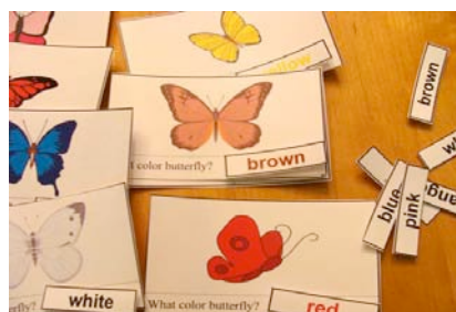
Read and match color words