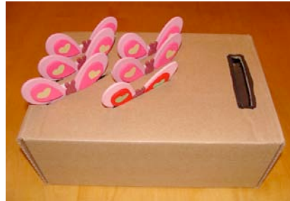
Put-in wooden butterflies

Task sets are not recommended for students who put non-edible items in their mouths.