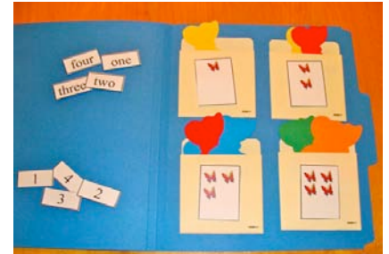
Count and match butterflies