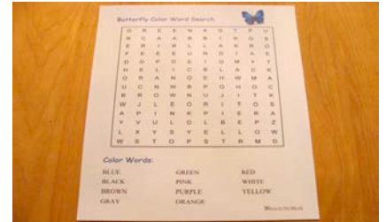
Butterfly color-word search