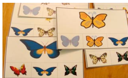
Identify matching butterfly