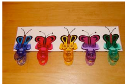
Butterfly color match