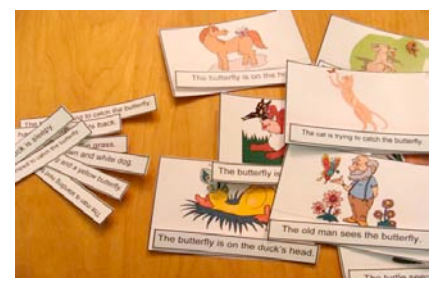
Butterfly reading comprehension